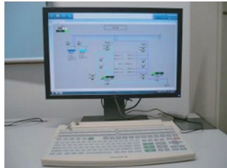
Human machine interface station with specialized keyboard

And this technology contributes to not only generating electricity but also growing new marine industry using deep seawater and spread of local employment.