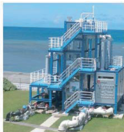
The OTEC plant on Kume Island